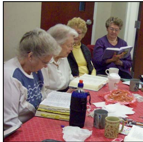
The Lamplighter's study the book of Job.