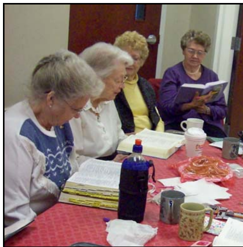
The Lamplighter's study the book of Job.