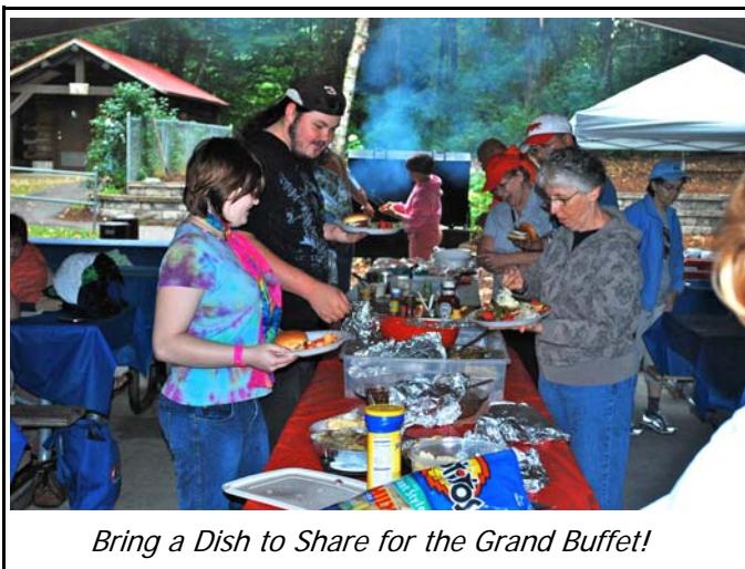
Bring a Dish to Share for the Grand Buffet!