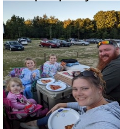
The Herlihy's celebrate family with a trip to the drive-in!