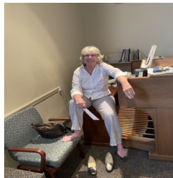
Ever wonder how the organist plays all those pedals properly?