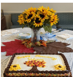
Our Beautiful Home Coming Cake!