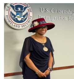
Our Hat Lady A Citizen after fifty years!!