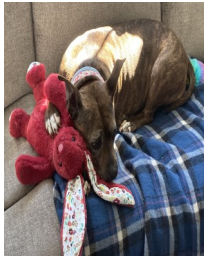
Lana Kimner & Easter Toy

MUMC folks are still finding & spreading JOY!