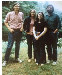
Do you know her the woman in the back row?