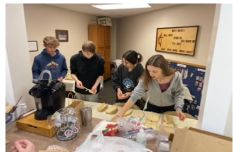
Super Bowl sub making with the youth mission group!