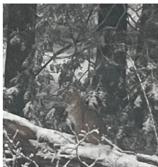
In like a lion! A bobcat in a backyard.