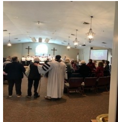
Out like a lamb! "If We All Said a Prayer"

Have you got pics of you & yours sharing the joy? Let's share here. Send to me; at office@milfordumc.org , or friend me on Facebook and share what you're up to.