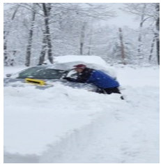
Doris Houston digs out the car after the big One!