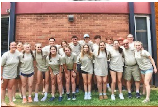
2023 Youth Mission Team