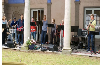
Our own MUMC Praise Band helping to celebrate 50 yrs. of Rolling Ridge Retreat Center,

Have you got pics of you & yours sharing the joy? Let's share here. Send to me; at office@milfordumc.org , or friend me on Facebook and share what you're up to.