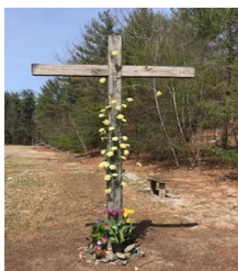
The Prayer Garden Cross on Easter

Have you got pics of you and yours sharing the joy? Let's share here. Send to me; at office@milfordumc.org , or friend me on Facebook and share what you're up to.