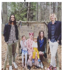
Some Harvey-Olson's pose for an Easter pic