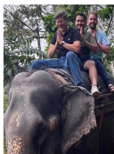
3 wise men on an elephant. You know the one praying in front.